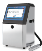
Continuous Inkjet Printer

*Please consult EC-JET for more information