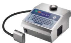
Large Character Inkjet Printer